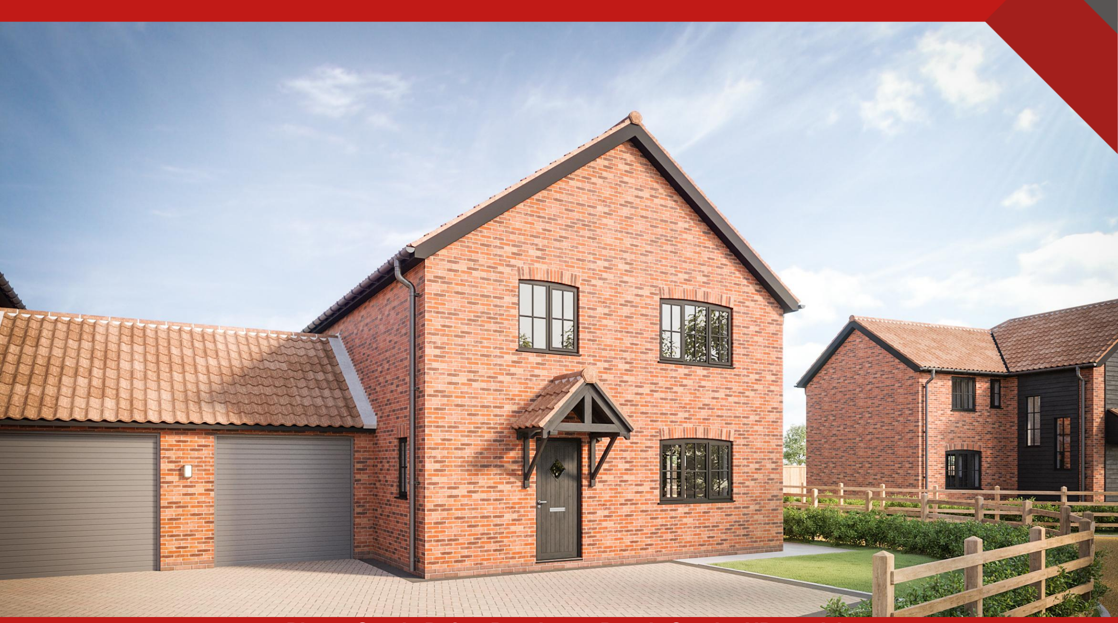
Plot 3, Castle Point, Butt Lane, Burgh Castle, NR31 9AJ Asking Price £450,000