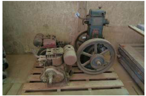
LOTS: 149 & 151