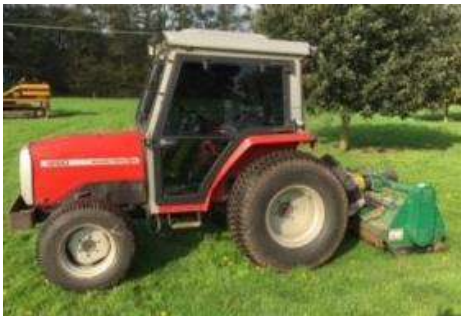
LOTS: 301 & 302