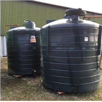
LOTS: 536 & 537