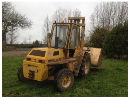
Lot 574 (bucket not included)