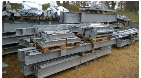
LOTS: 329 - 418