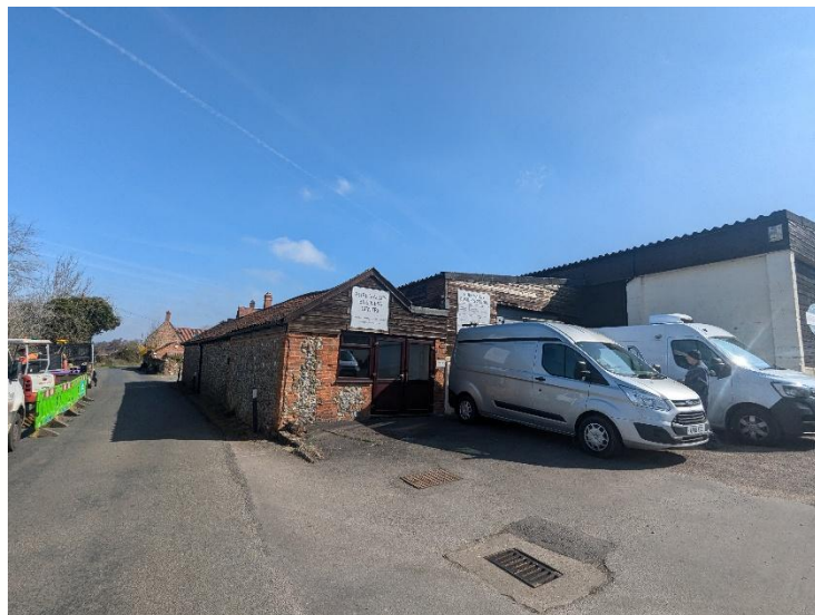
Entrance to BVBC