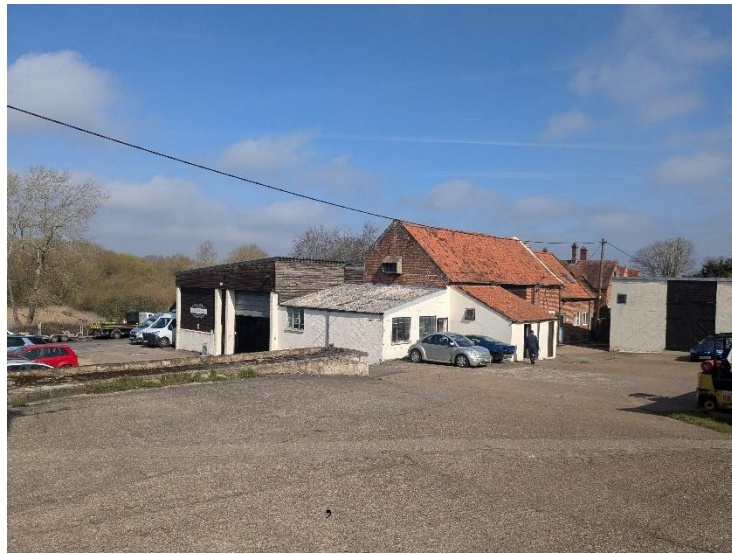
Unit 5,6,9 & 11