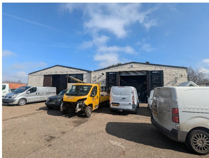
Unit 1 and 2