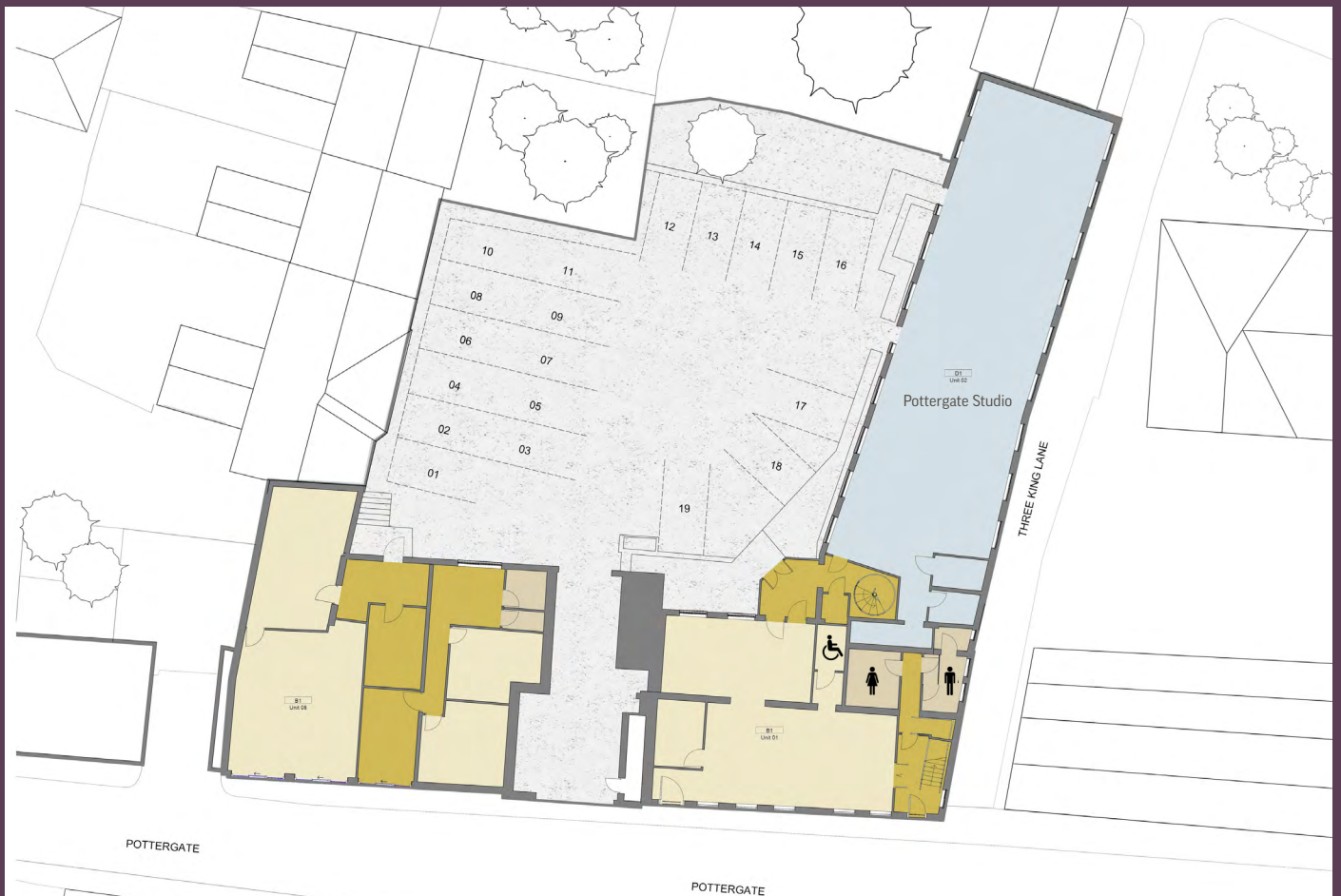
Pottergate House plan